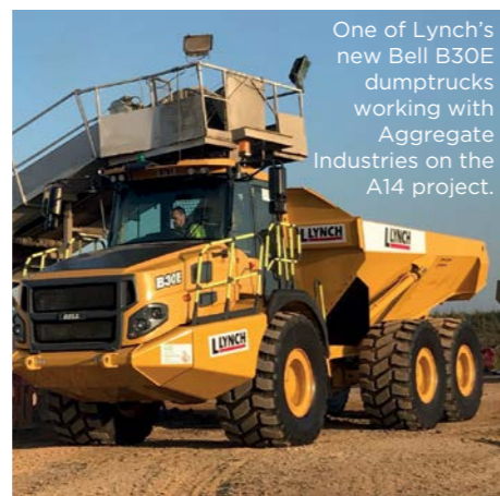
One of Lynch's new Bell B30E dumptrucks working with Aggregate Industries on the A14 project.