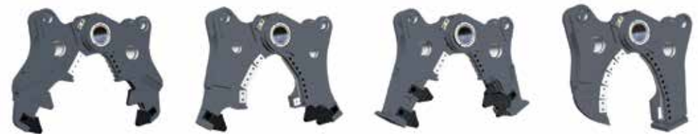
Jaw sets (left to right): Crushing • Demolition • Pulverising jaw • Shear set